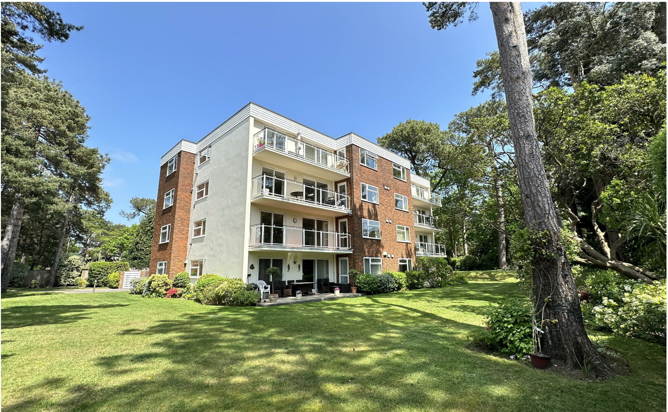
Flat 4 Kingsland Court Ravine Road, Canford Cliffs, Poole BH13 7HX £550,000 Share of Freehold